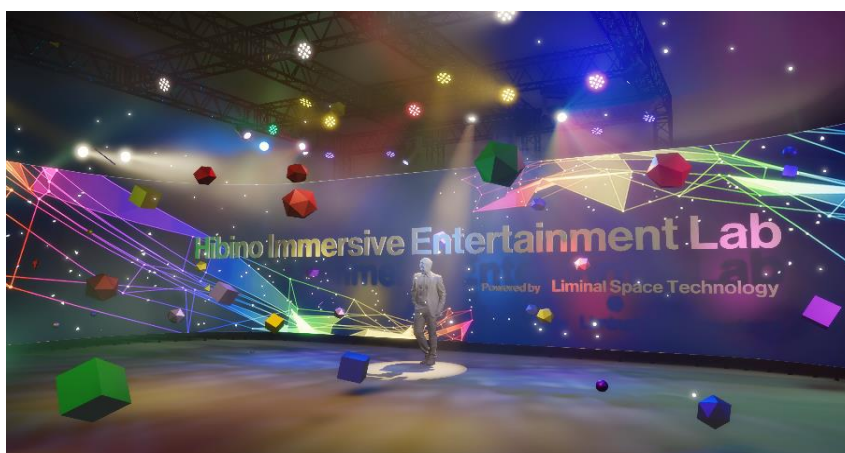
Hibino Immersive Entertainment Lab (conceptual image)