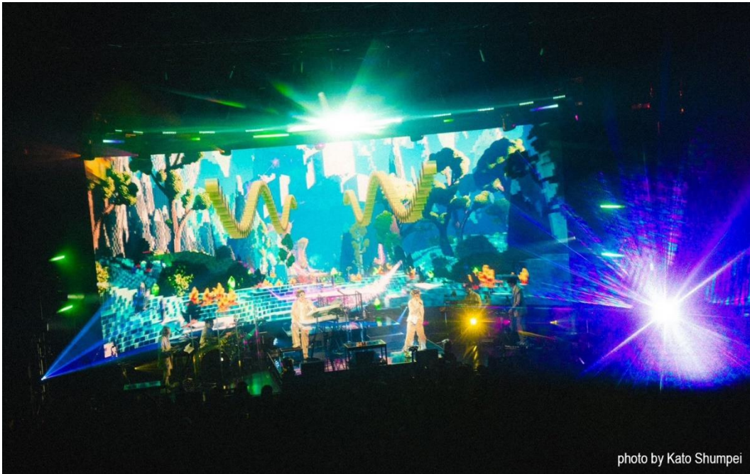
Scene from the song “Biri-Biri.” Looking through the 3D glasses, the viewers experienced voxel art flying in wave-like motion above the heads of the artists and the audience, creating the sensation of plunging into a world that sprawls far into the screen.

A majestic book emerged within the stage space. As its cover, inscribed with “POP OUT,” unfolded, the world of YOASOBI, based on a concept of “novel into music,” exploded into a 3D space. The audience was drawn into the POP OUT world alongside the artists. “Biri-Biri” drew its inspiration from fantasy realms and from the upbeat electropop that captures the essence of a video game soundtrack. It was a well-executed live performance on a virtual stage set within a voxel art world.